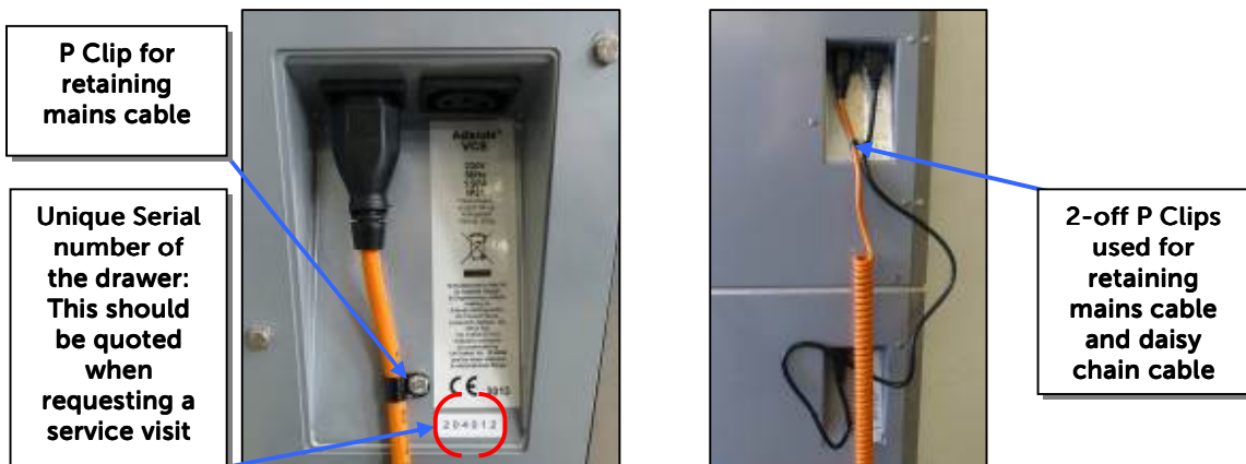
Figure 1: Mains Connection Point

Your Adande® drawer should be connected to a 230V, single phase, 50Hz, standard socket outlet supply. The drawer is connected to the mains supply with a detachable supply lead, one end of which is fitted with a standard 13 amp 3 pin plug. The other end of the supply lead, fitted with an appliance plug, is connected to the drawer as shown in figure 1 below.